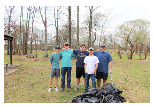
Delta Chi at Scotlandville's Disc Golf Park