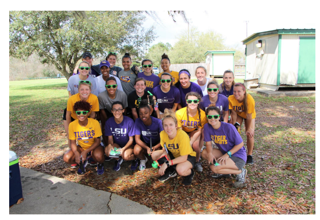
LSU Soccer at Airline Highway Park