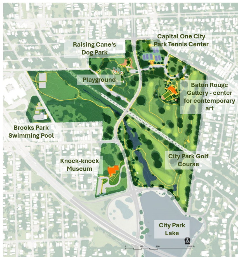
City-Brooks Park Existing Condition

Sasaki is working on a master plan that will define a long-term vision for City-Brooks Park, and will encompass ongoing programmatic uses such as museum expansions, golf improvements, circulation connections, and other recreational assets. Based on in-depth site analysis, the master plan will further refine key challenges and considerations in the effort to develop a cohesive, dynamic central park for East Baton Rouge Parish.